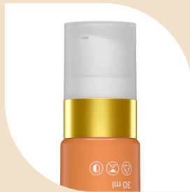
Frosted cap | with hot-foil collar