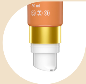
Hot-foil collar | and cap

Even with its streamlined material concept, it delivers maximum product protection. The advanced MDO-PE-EVOH barrier shields delicate formulas from oxygen and moisture, ensuring reliable protection and preserving quality over time. Thanks to the airless system, each pump stroke delivers precise, consistent dosing, enabling controlled use and minimising product waste.