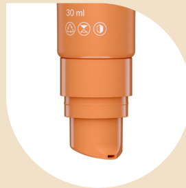
Tone-in-tone | pump and collar